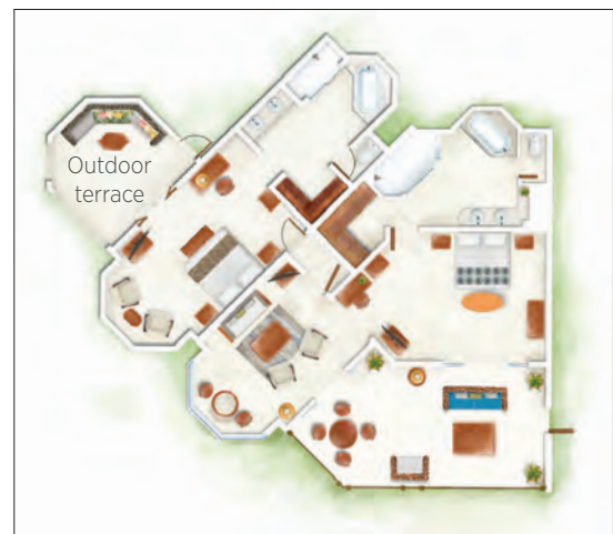
2-Bedroom Senior Family Suite (Beachfront)