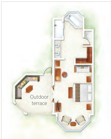
Junior Suite / Junior Suite (Beachfront) / Zen Suite / Zen Suite (Beachfront)