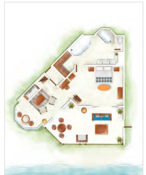
Senior Suite (Beachfront) / Senior Zen Suite (Beachfront)