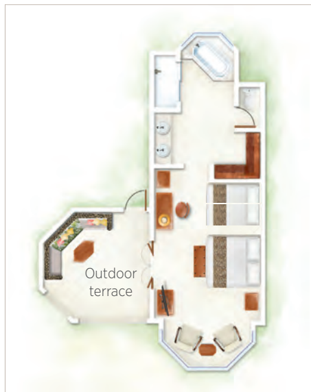
Junior Suite (2 adults + 2 children) / Junior Suite (Beachfront) (2 adults + 2 children) / Zen Suite / Zen Suite (Beachfront)