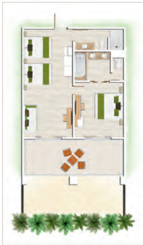
2-Bedroom Garden Facing Apartment