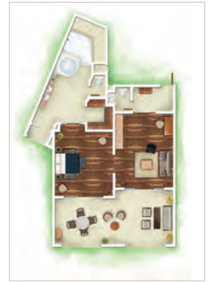
Senior Suite Beachfront