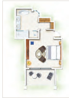
Paradis Beachfront / (2 inter-leading make up the 2-Bedroom Paradis Family Suite Beachfront)