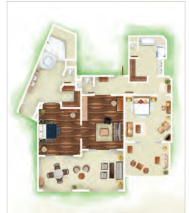
2-Bedroom Senior Family Suite Beachfront