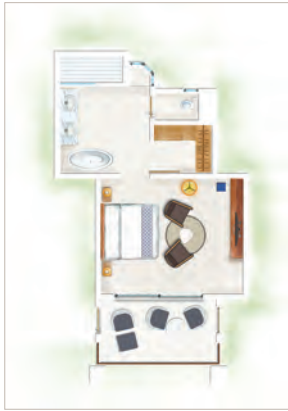
Paradis Bay Facing