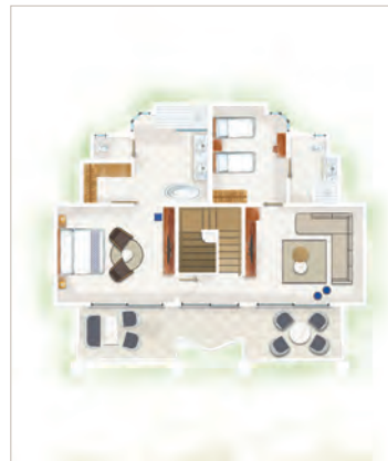
2-Bedroom Paradis Luxury Family Suite Beachfront