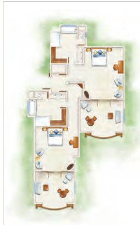
2-Bedroom Junior Family Suite