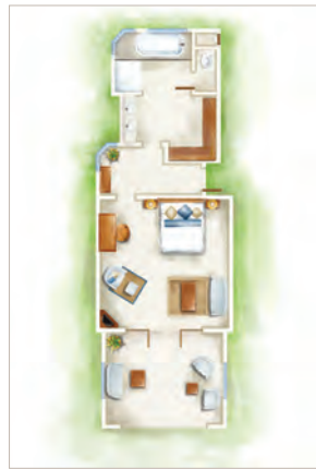
Junior Suite / Junior Suite Beachfront / (2 inter-leading make up the Family Suite version)