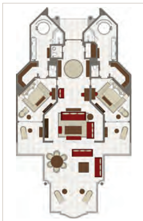
Crystal Rock Suite, Coin de Mire Suite , Gabriel Island Suite