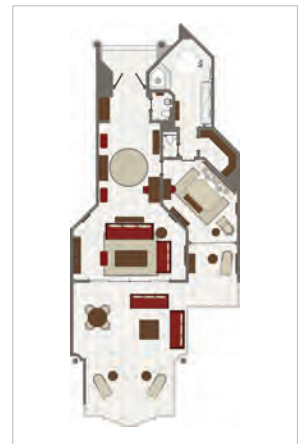
Ambre Island Suite