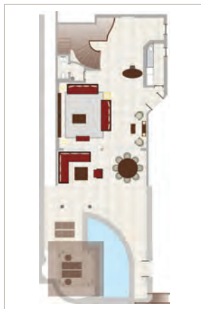
Royal Suite - Ground Floor