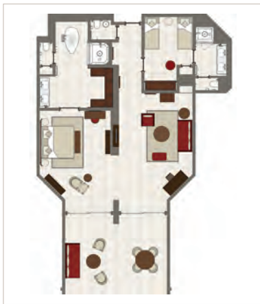
Palm Suite Family