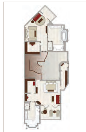
Royal Suite - First Floor