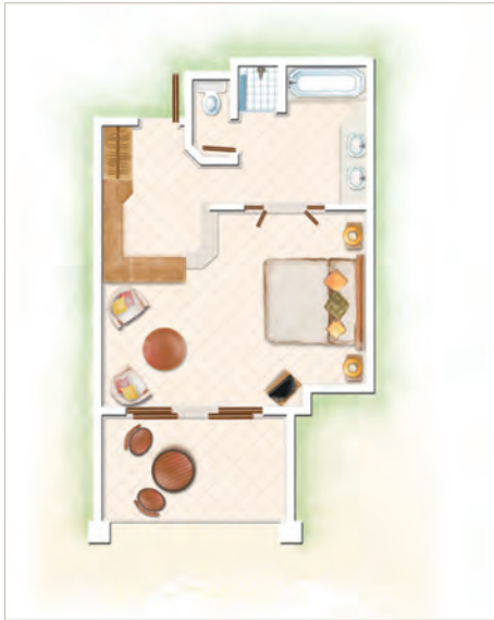
Superior Room / Superior Ground Floor