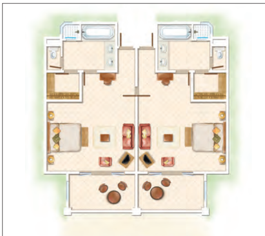
2-Bedroom Deluxe Family Apartment