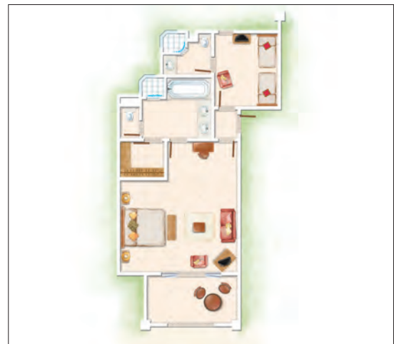
2-Bedroom Family Apartment