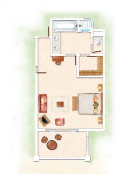
Deluxe Room / Deluxe Ground Floor