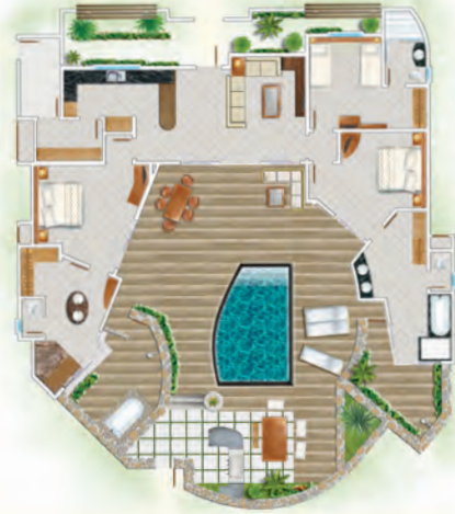
3-Bedroom Pool Villa