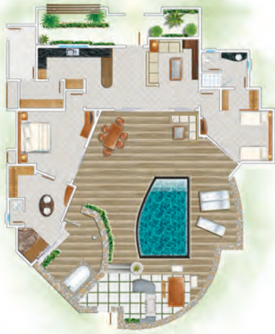
2-Bedroom Pool Villa